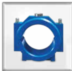
NL 2010 X / 006 – A 001