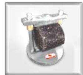
NL 2010 X / 004 – A 004