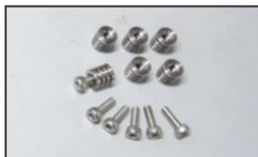
Inserts & Contact Points