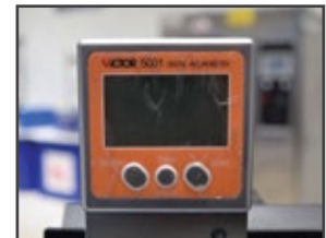
Digital Angle Measurer